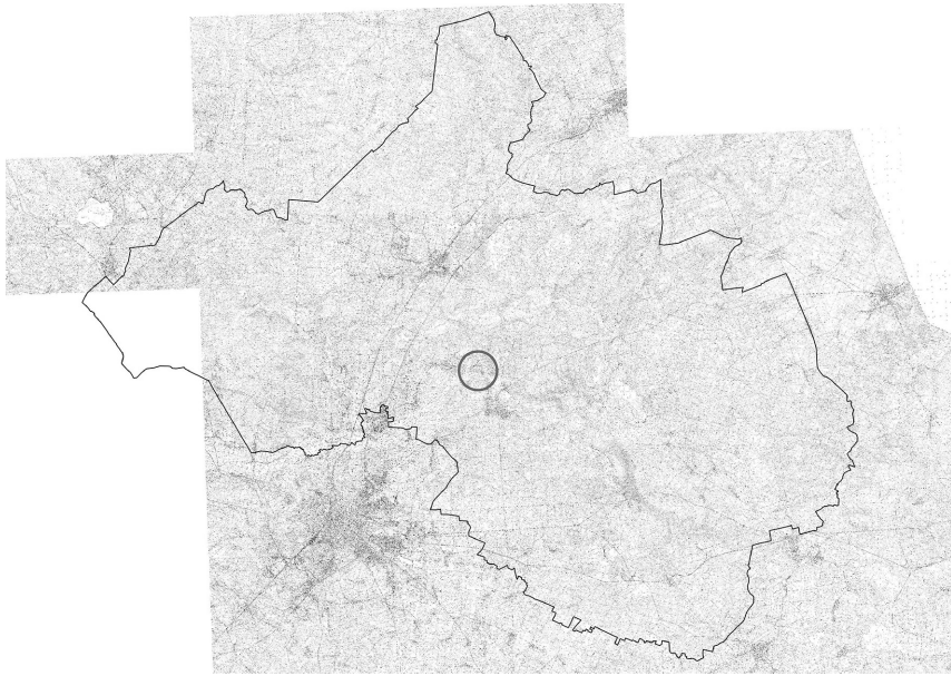
Figure 1. Location of the study area (red circle) within the Knyszyn Forest Landscape Park